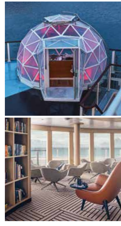
From top: igloo; library with a view.

WELLNESS: The vessel is staffed by our wellness specialists and features a glass-enclosed yoga studio, gym, treatment rooms and spa relax area, and high and low-heat saunas with ocean views.