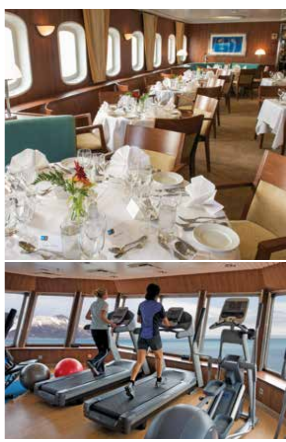
From top: the dining room has unassigned seating and an informal atmosphere; glass-enclosed fitness center with 180 degree views.

WELLNESS: The vessel is staffed by a wellness specialist and features a glass-enclosed fitness center, outdoor stretching area, a LEXspa treatment room and sauna.